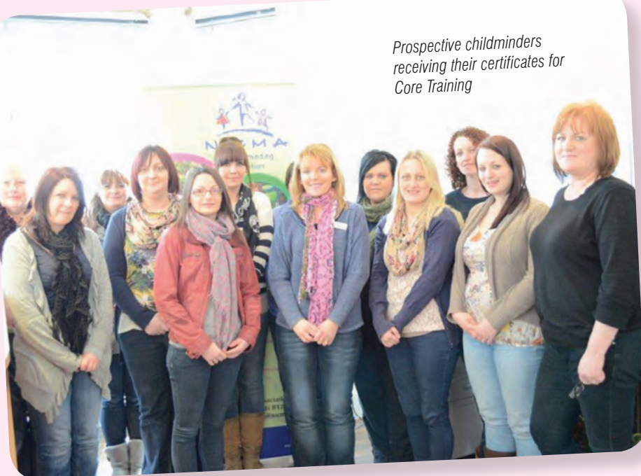
Prospective childminders receiving their certificates for Core Training

During March 2013, Network Personnel in Ballycastle organised a funded employment training package for a group of 12 people wanting to become childminders . NICMA were crucial partners, delivering the statutory required training in Safeguarding, Health and Safety and adding valuable knowledge and skills with specific Business and Record Keeping training focused on child minders' particular situation. Together with their Paediatric First Aid and Disability Awareness, NICMA training made our group of trainees optimally set up to embark on successful child minding careers.